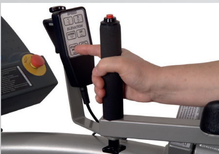
Arm support ideal for overweight patients and for people with orthopaedic problems or cardiovascular disease