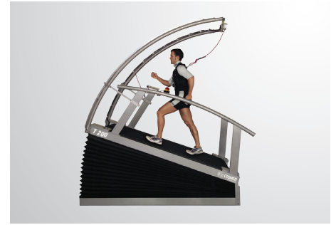
Elevation can be controlled either with user terminal or with PC software