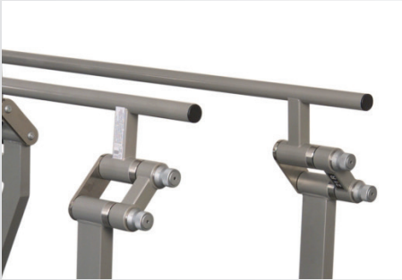
Adjustable (in height and width) handrails for maximum safety and movement freedom of children or elderly patients