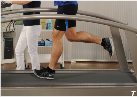
Long handrails with two pillars offer safety and comfort in case of special applications