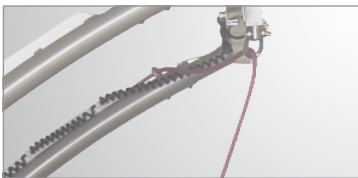
Fall stop at the crossbar of the safety arch