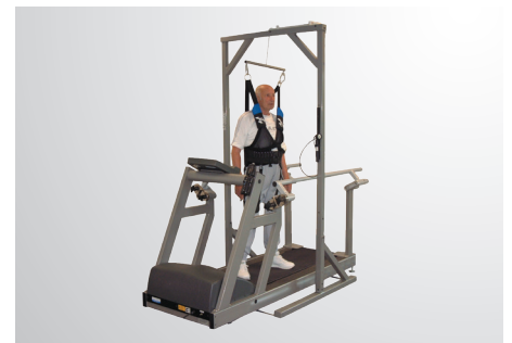
Unweighting system (Airwalk) for rehabilitation and for physiotherapy applications