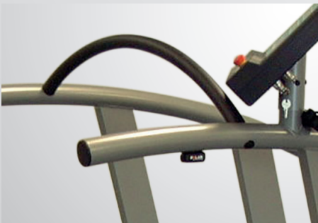
A bent crossbar is available as standard accessory for all T150 and T170 models