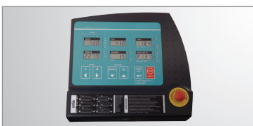
Clear and user friendly user terminal (available on all models)