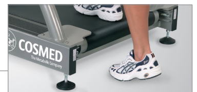
The low height track access is ideal also for seniors, orthopaedic patients and other clinical applications