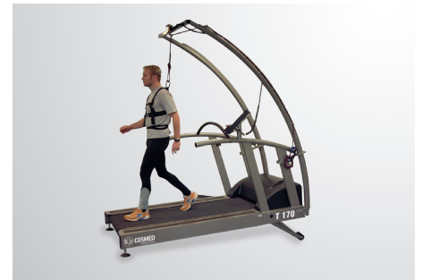
Downhill motion and downhill gait therapy is possible with belt reverse rotation module (standard feature on T170 Sport and T200 models)